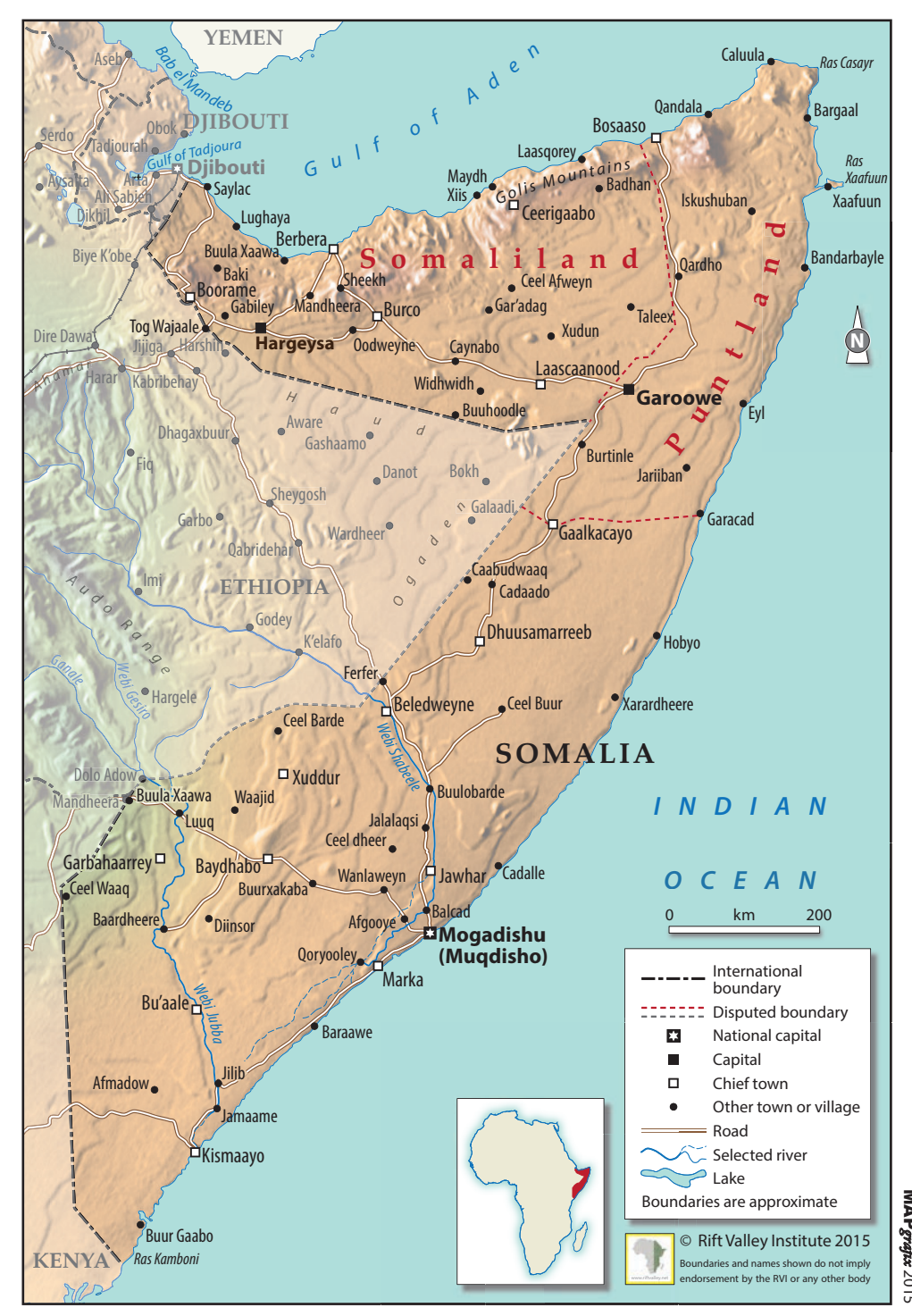
Map 2. Somalia