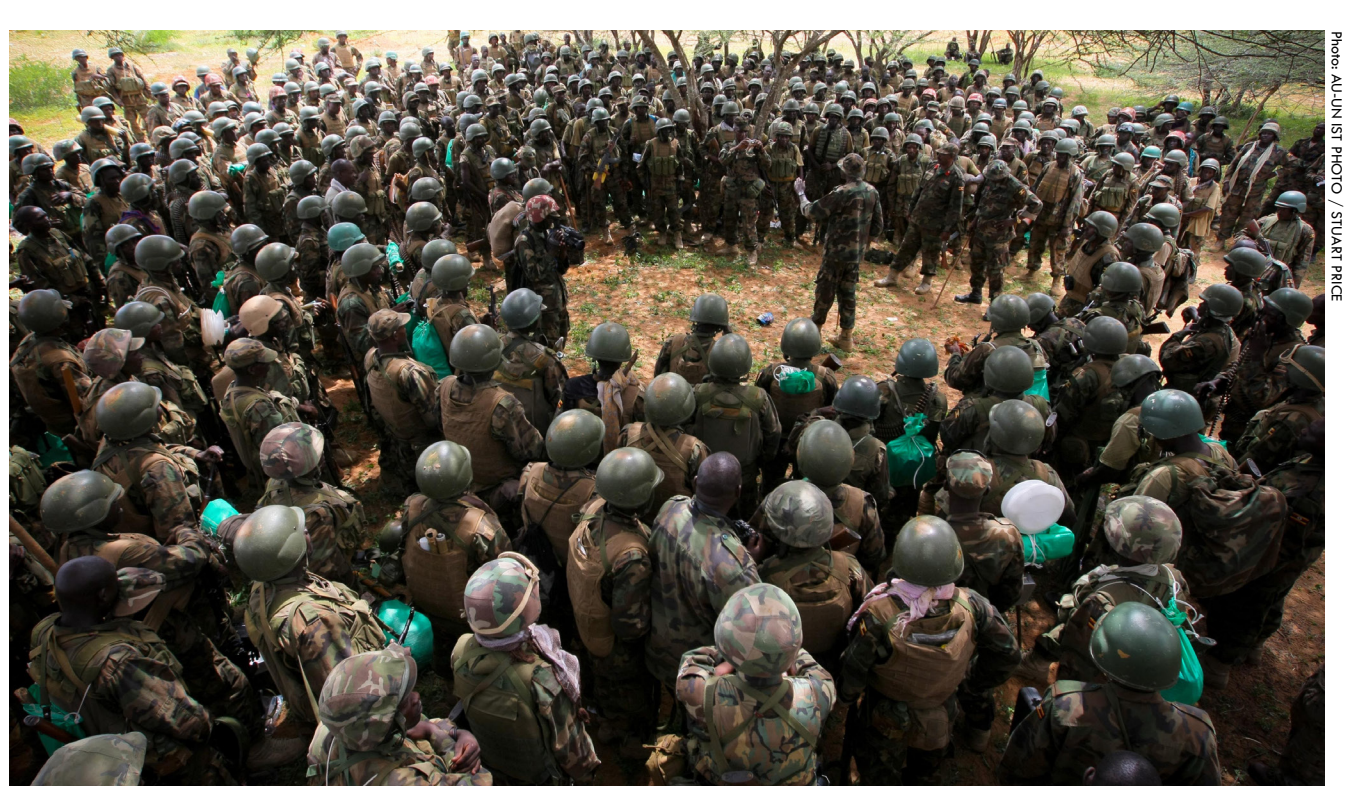
AMISOM (African Union Mission in Somalia) prepares to advance on a town in Somalia held by the al-Qaeda affiliated group al-Shabaab. The Kenyan military involvement in Somalia began October 2011. Al-Shabaab has stated that they will target all those who voted for the Kenyan government that sent troops to Somalia.

Kenya, seen as a key ally in the War on Terror by the US and UK, has received international help, especially after the Westgate attack. As mentioned, security has been beefed up, often inconveniencing the innocent, but the Kenyan military and police often fail to work together effectively, and there have been lapses in the use of intelligence to prevent attacks.