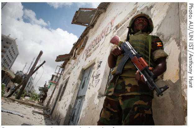
State terrorism plays into the hands of extremists. Anti-terrorist measures must not overrule human and citizens' rights.

Thus, we may only have seen the beginning of terror acts in Kenya, unless the actors find ways to cooperate in order to prevent the threats.