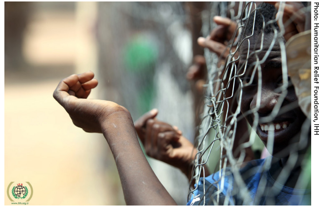
Dadaab refugee camp. The major refugee camps in Kenya have traditionally been recruiting grounds for terrorists. Now recruitment is much more widespread.

The Kenyan military has accused the police and