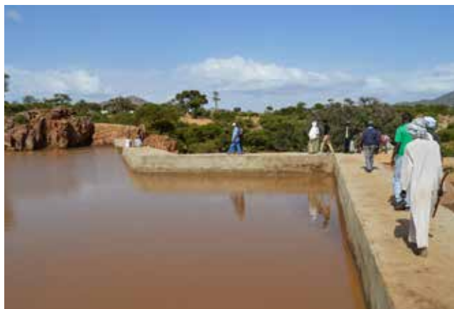
Dam at Geleb

For some years, EU funds have been contributing to a food security project in the Geleb sub-region. This area, with its 30 000 strong population, located in the Anseba region (approximately 100 kilometres northeast of Asmara), is regularly affected by drought. Average yearly rainfall here is less than 300 millimetres