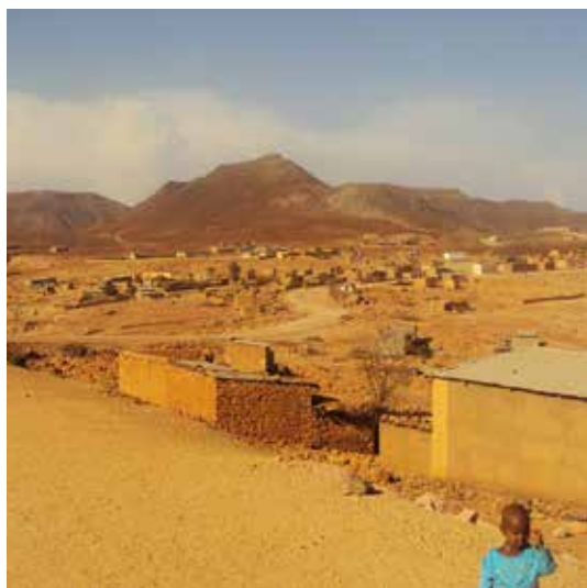
A village located in the Debub region which is to be provided with electricity

In November 2014 the EU signed an agreement with the Eritrean government regarding the installation of a solar energy facility in Areza and Mai-Dima sub-zones, which are located in Eritrea's Debub (southern) region. The objective of the project is to provide a clean, affordable and sustainable supply of electricity for 40 000 people in 28 rural and semi-urban communities that are far from the national grid and have limited or no access to modern energy. Apart from providing electricity for households, the action will also promote commercial and manufacturing enterprises and generate new jobs and income for the beneficiary communities.