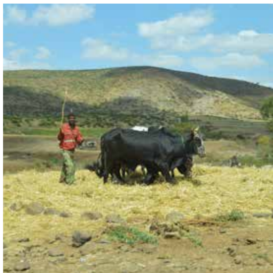
Harvesting work near Mendefera

Eritrea possesses more than 2 million hectares of arable land, 600 000 of which could be irrigated all year round. However, low domestic crop and livestock productivity and production, combined with adverse climatic conditions, remain problems that undermine the country's food security. Eritrea has 1 200 kilometres of coastline on the Red Sea with substantial, yet largely unexploited, fishing potential.