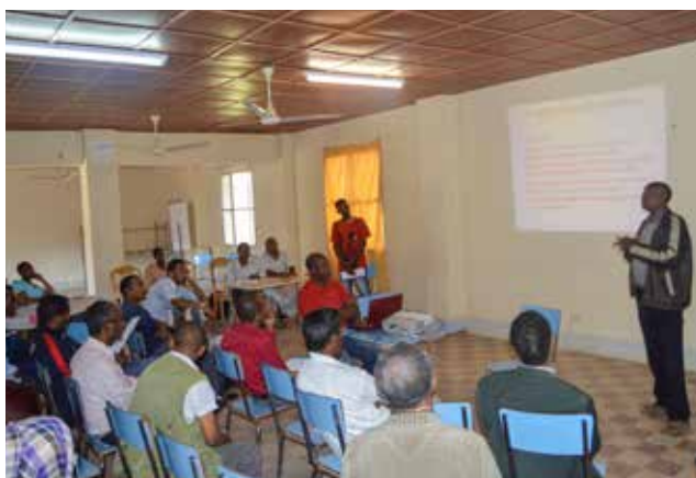
Training of public servants in Embatkala

The project enshrines the establishment of ERCOE knowledge and research networks and a strengthening of the capacity of public administration. This will happen through ERCOE staff capacity building and the creation of links with similar institutions in ACP and EU countries. Moreover, ERCOE's infrastructures and logistics located in Embatkala, 40 kilometres east of Asmara, will be upgraded by a photovoltaic system with a total value of EUR 1 million. Thanks to the simultaneous and coordinated use of photovoltaics, batteries, diesel generators and an intelligent interface, this system can also supply the national grid with any surplus of electricity produced.