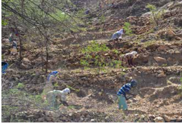
Community works to curb erosion

nurseries and private agricultural plots. Moreover, more than 37 kilometres of hillside terraces have been constructed to fight soil erosion and prevent siltation of the new dams. New crops are introduced, such as fruit trees, which will diversify income and improve the nutritional status of households in the Geleb area.