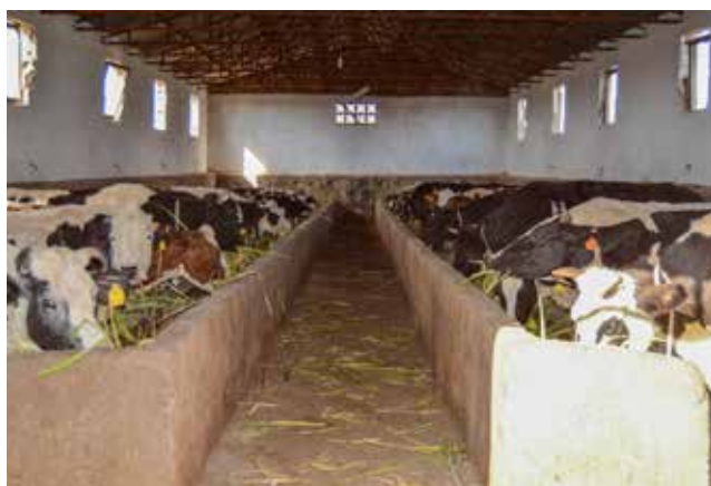
Cowshed near Mendefera

World food prices increased dramatically in 2007 and 2008, creating a global crisis and causing social unrest in various parts of the world. Following this dramatic increase, the objective of the facility was to increase agricultural production between 2009 and 2013 in order to overcome the challenge of global soaring