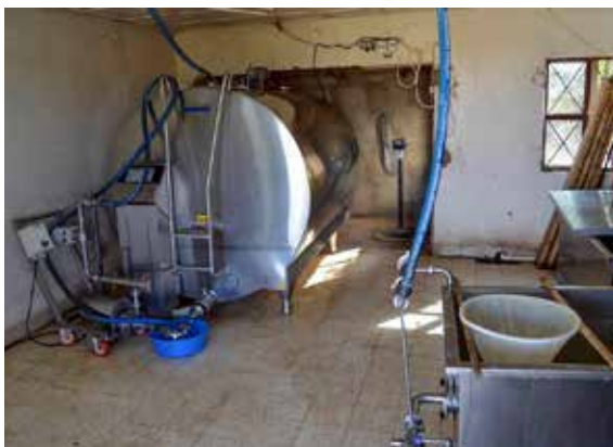
Milk collection centre in Mendefera

The programme also supports sector governance through the revision of sector policies and regulatory frameworks, as well as enhancing the capacity of the National Agricultural Research Institute (NARI).