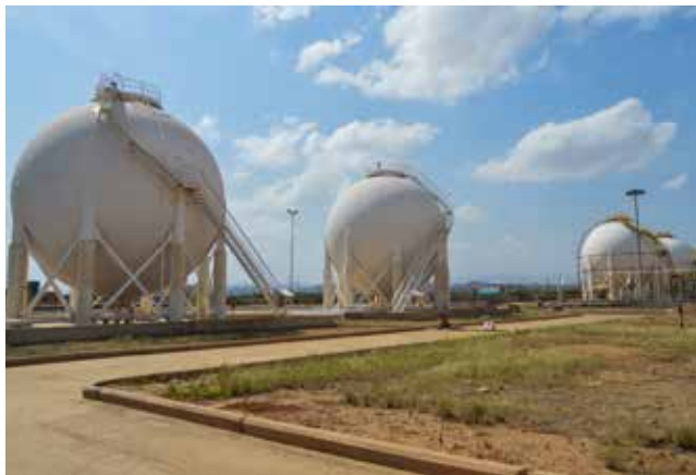
LPG tanks in Massawa

the demand. Moreover, due to limited capacities only small LPG transport ships were bringing LPG to Eritrea, which increased the price.