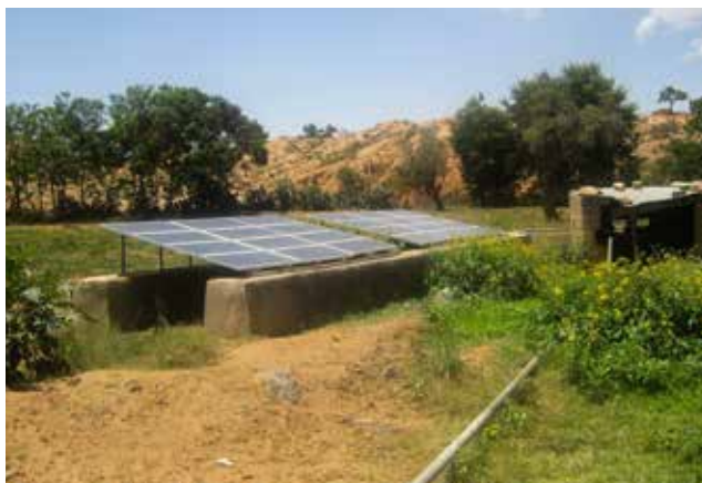
Solar panels in Geleb

Currently, Eritrea relies largely on biomass fuel, which accounts for about three quarters of all energy consumption. The country is dependent on imported fossil fuels for all modern commercial energy supplies. This heavy dependence is unsustainable. Reliance on biomass fuels causes a considerable degree of environmental damage: land degradation because of deforestation and decline of agricultural soil fertility due to the use of agri-residue and animal droppings for fuel. Using biomass for cooking also causes severe health issues, such as chronic respiratory diseases. The importation of large amounts of fossil fuels annually requires large allocations of public funds. Due to the current under-exploitation of sustainable indigenous energy sources, growth in energy consumption requires increasing petroleum product imports, further compromising the country's energy independence and affecting the security of its supply.