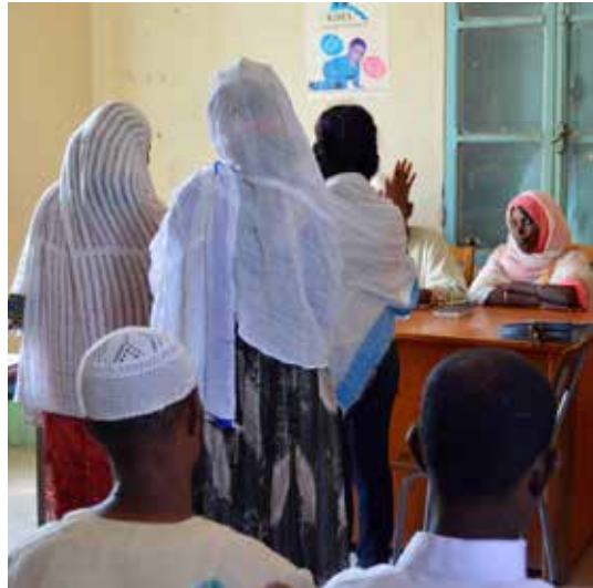
Community court in Keren

The NIDP also underlines the need for improved capacity for planning and implementing development programmes, as well as improved statistics and research on economic indicators and dynamics. The European Union understands the importance of supporting good governance and working with Eritrea in this key area. The cooperation focuses in particular on strengthening the rule of law and access to justice, on building the capacity of the Eritrean public service and on enhancing economic governance.