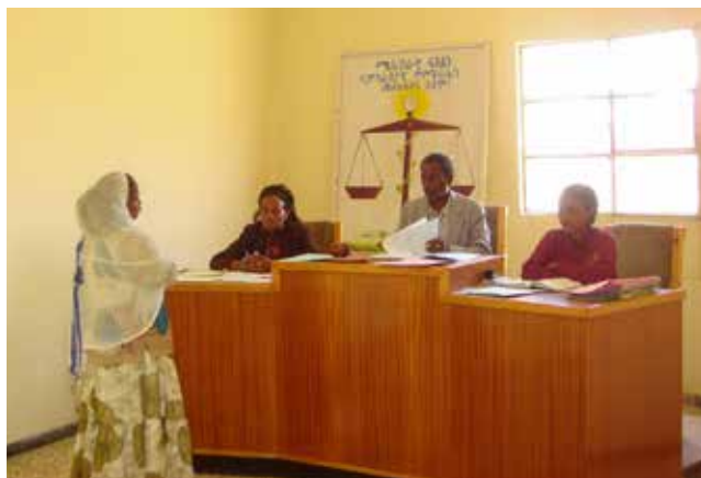
Court in session

The project includes a capacity-building component and an infrastructure component. In the framework of the capacity-building component the programme aims to fully integrate the traditional systems of the community courts and customary law with the formal rule of law. Approximately 1 200 community