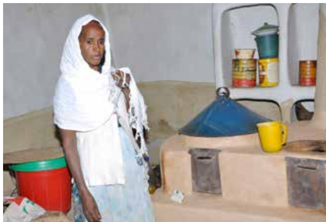
An improved fuel-efficient stove

Eritrea is gifted with an excellent location when it comes to the potential for renewable energy. The country has solar resources accounting for around 5 to 6 kWh/m 2 /day, which ranks it among the areas with the highest levels of solar radiation in the world. Moreover, Eritrea has large wind energy prospects, especially