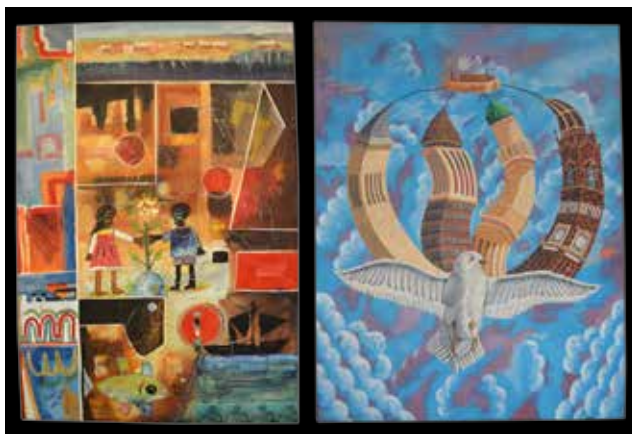
Winning works from the art competition

co-organised by the EU delegation and embassies of EU Member States present in Asmara (Germany, France, Italy and the United Kingdom), as well as by the non-resident EU Member States' embassies.