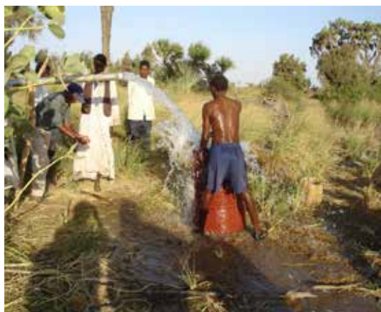
Water source in Tessenay

Access to sanitation facilities is a key issue in order to reduce household vulnerability. In this context, the engagement of the local communities in the management of their water resources and infrastructure is a key component to increase resilience to environmental risks and shocks.