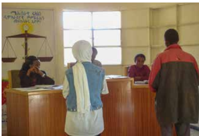
Community court in Dekemhare

Community courts are the first level of jurisdiction in Eritrea. Some 85 % of all court cases are dealt with at this level. Community courts were set up by the government via Resolution No 132/2003 with the objective of institutionalising the traditional dispute resolution system. Their creation and design are justified by the capacity shown by grassroots communities across the country to solve litigation cost-effectively on the basis of their customary procedures in compliance with national and international law. The elected judges of these courts are mandated to solve disputes of a civil and criminal nature, within a limited jurisdiction, whenever possible by conciliation.