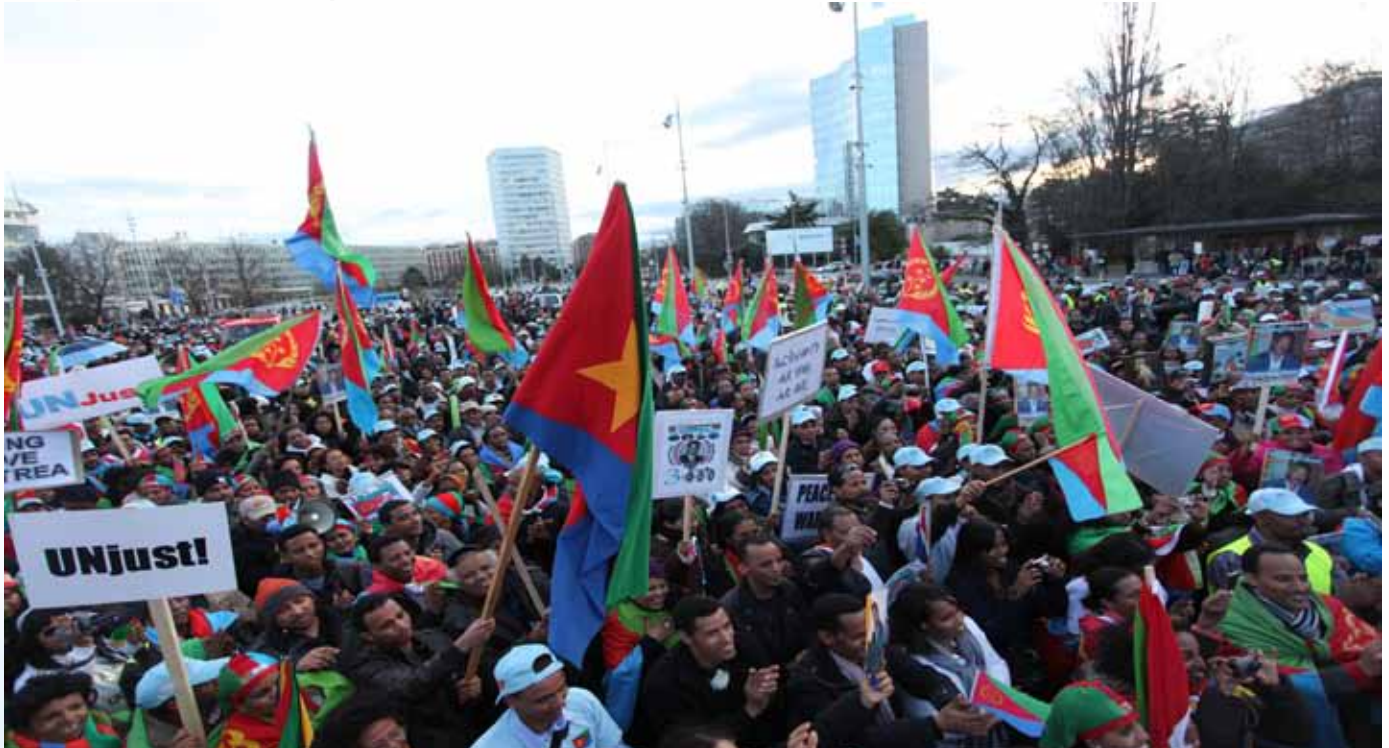
Eritrean Communities from around Europe demonstrating in Geneva against the illegal and unjust Sanctions

... In view of the absence of any intelligence, real or fabricated, linking Eritrea with Shabaab for over four years, the UN Security Council should terminate sanctions imposed in 2009 by UNSC resolution 1907." 13