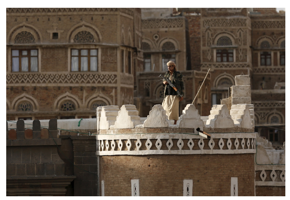
A Houthi fighter stands guard in Sanaa and secures the site of a demonstration by Houthis against the Saudi-led air strikes (1 April 2015).

After the "Yemeni Revolution" of 2011, power struggles among the country's political elites continued. Just as in Tunisia and Egypt, the opposition in Yemen also protested the authoritarian rule of President Ali Abdullah Saleh, who had been in power in Sana'a since 1978. The conflict