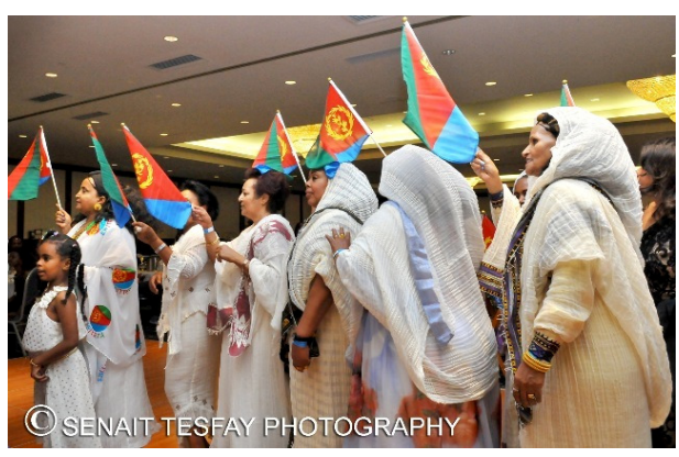
Eritrean Festival - US East Coast Washington DC, 7-9 August 2015