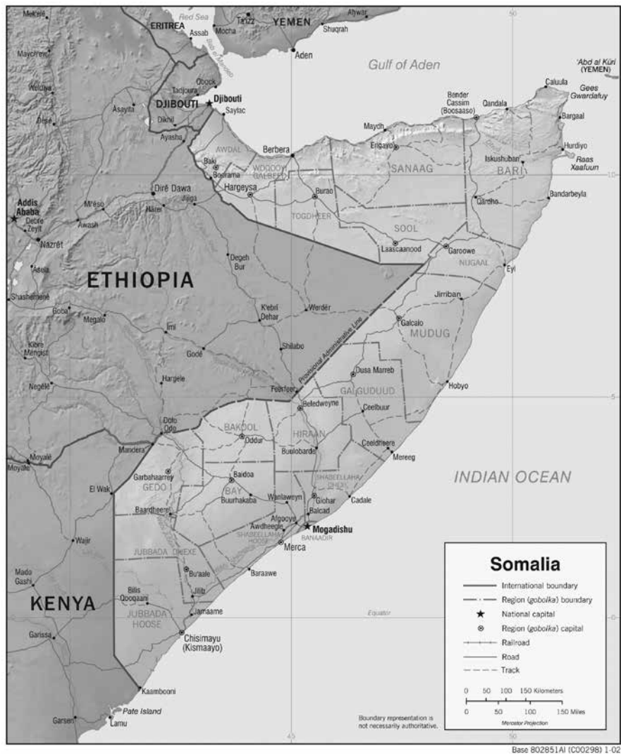
Map of Somalia