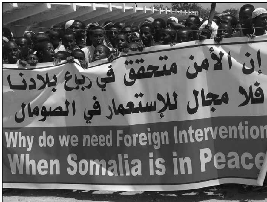
Figure 1. Demonstrators in Mogadishu protest foreign interference.

on Villa Somalia and the port. But the Ethiopian army stayed in Mogadishu and remained the visible guarantor of the TFG's safety, patrolling the city's streets. Ethiopian soldiers were accused of committing a wide range of atrocities, including firing mortars on civilian hospitals, press institutions, and houses, and rape, theft, kidnapping, and murder of Somali civilians. 15