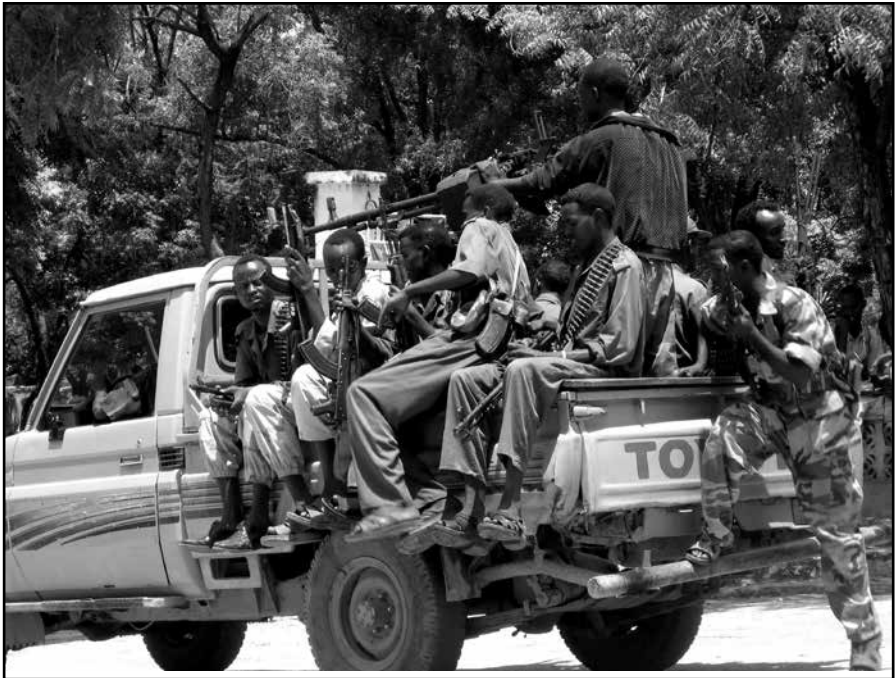
Figure 2. TFG soldiers patrol Mogadishu.

that AMISOM had used unnecessary force and targeted heavily populated quarters and markets far away from the fighting area(s) which can only be taken as deliberate mass killing. Since AMISOM had not come with the consent of the Somali people, lately we have been spending a significant amount of time and efforts to convince our people to accept AMISOM as a peace keeping force, but the latest terror has seriously damaged the image of the mission of AMISOM in Somalia ... We consider this AMISOM action as a war crime; therefore we urgently request the UN as well as AU to send an impartial fact find [sic.] mission at the earliest possible time to investigate these atrocities and swiftly bring the culprits to justice. 26