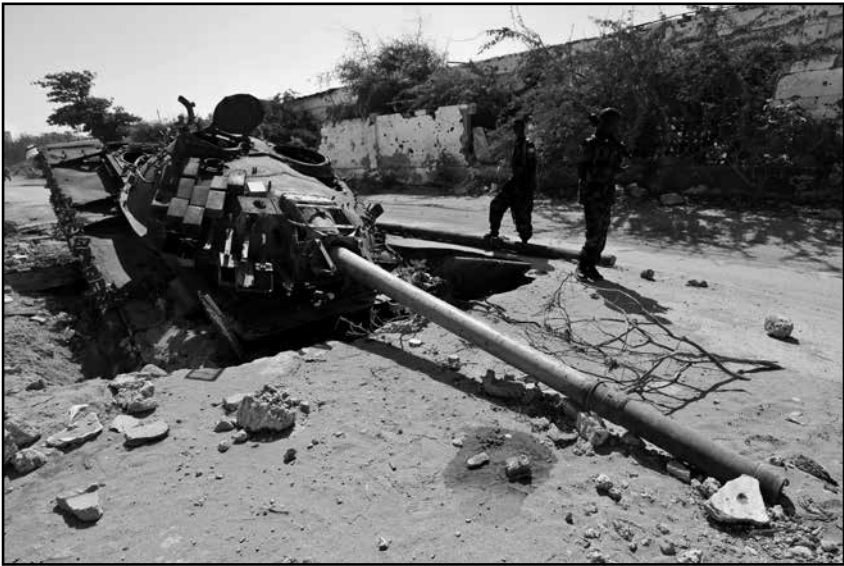
Figure 6. AMISOM soldiers stand near a burnt out AMISOM tank in Mogadishu.

This period also saw AMISOM occasionally forced to conduct vicious street-fighting with enemy forces sometimes less than 50 meters away from its positions. Al-Shabaab's fighters tended to traverse the city in small units of 10 or so fighters, but its network of underground tunnels also meant that it could mass a significant force—of up to 100 fighters—very quickly when peacekeeping patrols were spotted in the city. AMISOM's indirect fire weapons were thus often used danger close, i.e. within the minimum safety distances for AMISOM troops as well as any present civilians. Tunnels and pit traps were also used by al-Shabaab to snare AMISOM tanks and armored vehicles. 160