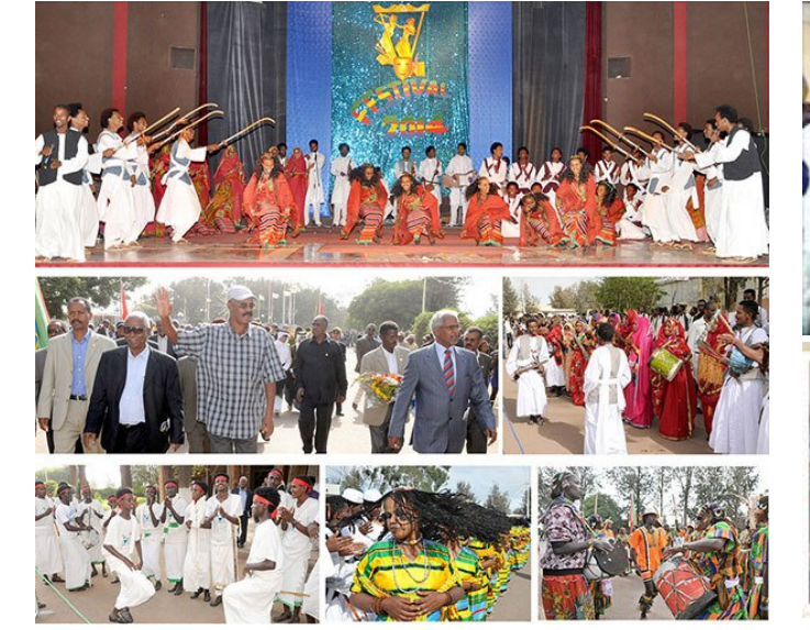
Asmara, 16-23 August 2014