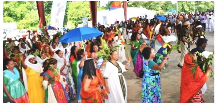
Washington D.C., 8-10 August 2014