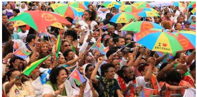
Bologna, 4-6 July 2014