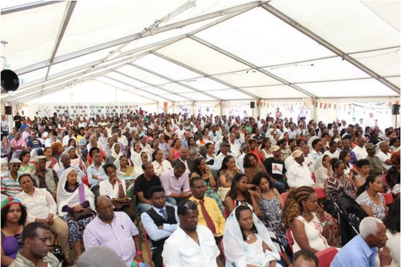
Eritreans @ Festival 2013 UK

Now the misinformation is on the 2%. Here I will try to expose the misinformation of their baseless accusation.