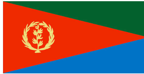
Program continued (3)