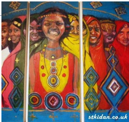
Program continued (2)