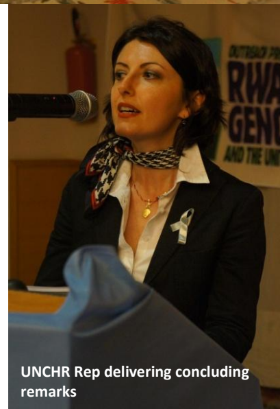
UNCHR Rep delivering concluding remarks

The United Nations 1948 Convention on the Prevention and Punishment of the Crime of Genocide (known as the “ Genocide Convention ”) defines genocide as any crimes committed with the intent to destroy, in whole or in part, national, ethnical, racial or religious groups.