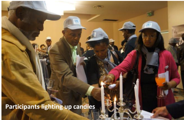
Participants lighting up candles